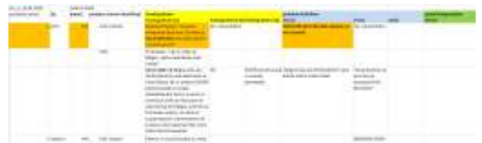
figure 1: Research instrument developed (excerpt)

was created, containing categories and values added. We chose to create categories based on the need to observe what framing devices - either linguistic, visual or audio - were employed by the media in order to propose problem definition, causal interpretation, moral evaluation and treatment recommendation (see figure 1), since Entman's definition of framing was used for evaluating linguistic frames.