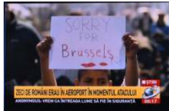
peace frame, D24-J4