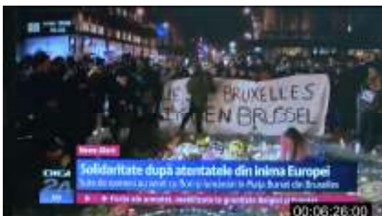
peace frame, A3-J4