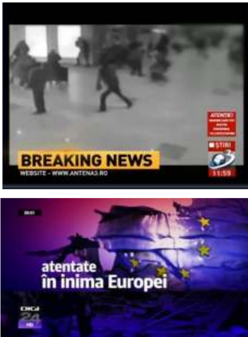
figure 3 special video teases captures - Antena 3 (up) and Digi 24 (down)