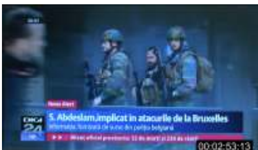
war frame, D24-J4