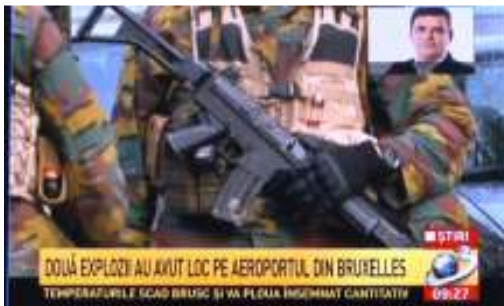
war frame, A3-J1